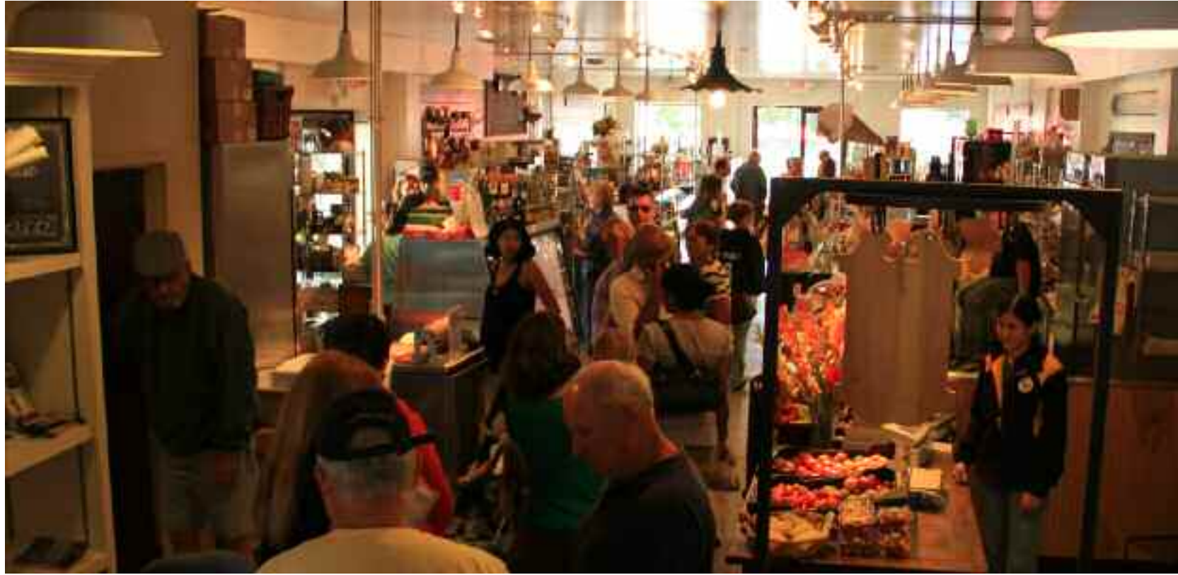
Above: Easton Market Square is a busy place on Saturdays. Right: A wide variety of goods are available at the market.