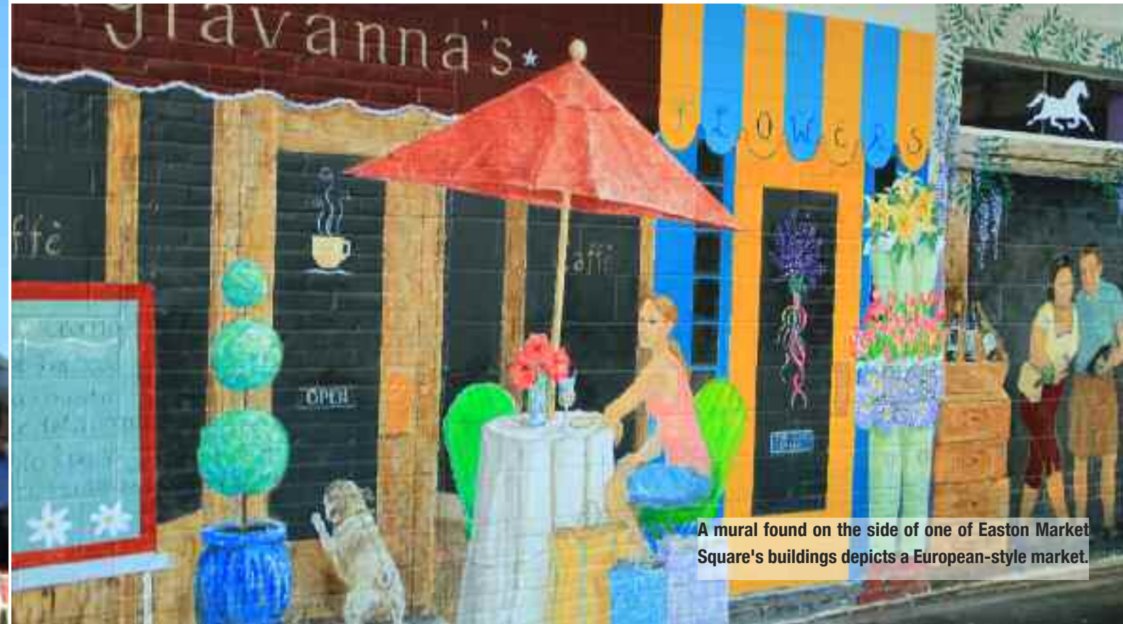
A mural found on the side of one of Easton Market Square's buildings depicts a European-style market.

For Easton Market Square, Jackson has reclaimed an underused group of buildings and parking lots on North Harrison Street, located next to the parking lot where the Easton Farmer's Market is held in season on Saturdays. He envisions converting the space into a full-time public market that will serve as the community hub. Customers will visit the market to connect with farmers, shop owners and community.